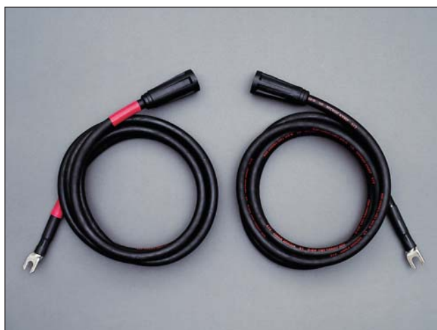
Cable set, GA-00554