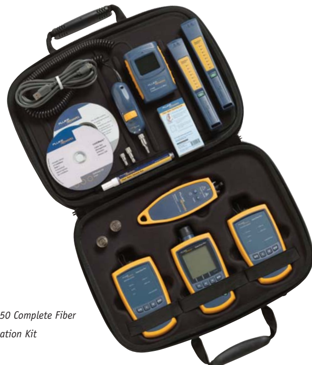
FKT1450 Complete Fiber Verification Kit