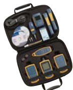
Both multimode and singlemode sources are available in the FTK1450 Complete Verification Kit