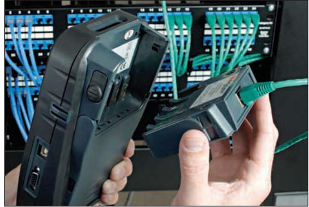
SCT Series adapter employs new "connector-less" adapter technology.

The SCT Series speeds the user through link diagnosis with powerful diagnostic tools found only on the Megger SCT. The instrument pinpoints the distance to link disturbances on each measured pair and displays this data in multiple helpful formats. After completing a certification test the user can choose to generate and display diagnostic results. Diagnostic wiremap displays the length to an open or short on each pair. Diagnostic TD NEXT and TD Return Loss measurements quickly and accurately calculate the distance to and the strength of all disturbances on each measured pair on a percentage scale, where values exceeding 100% are an indication of a link failure. Summary TD NEXT and TD Return Loss display the distance and strength of the single worst disturbance for pinpointing the worst fault. Detailed TD NEXT and TD Return Loss display the distance and strength of each pair's worst case disturbance for quickly pinpointing one or more faults. This is highly useful for confirming connector or cable failures. Graphic TD NEXT and TD Return Loss display every pairs disturbances vs. distance on a graph for pinpointing all possible faults. This is highly useful for diagnosing all possible link failures.