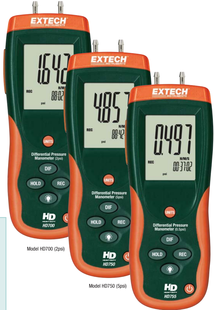
Model HD700 (2psi)