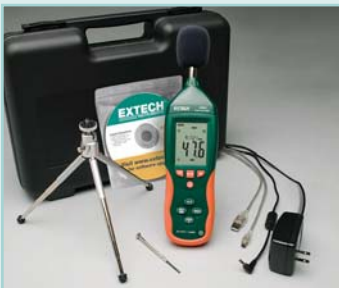
Meter and accessories are packaged in a rugged hard carrying case for added protection