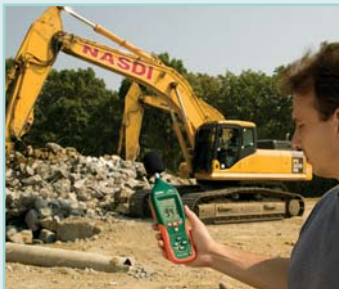
Meets new IEC 61672-1 Class 2 accuracy standard for OSHA and other local and national noise ordinances