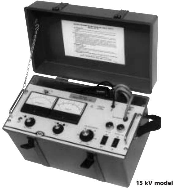
15 kV model